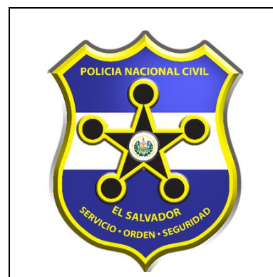
Fig. 1: Patch of the Policía Nacional Civil de El Salvador (PNC) or, in English, the National Civil Police of El Salvador

When it came time to buy Dulce's November medicines, Armandez simply didn't have the funds. But he wrote Pitts Pharmacy a check for $100 anyways. When his check bounced, Pitts Pharmacy called the police.