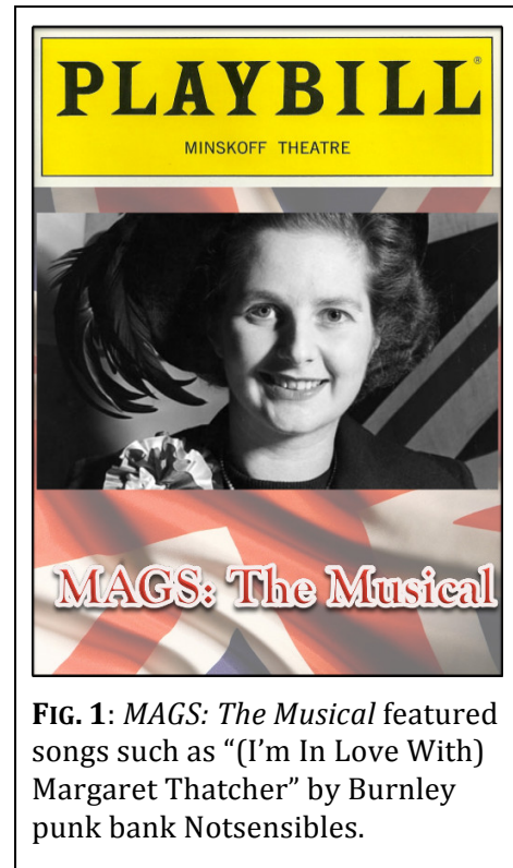
FIG. 1: MAGS: The Musical featured songs such as "(I'm In Love With) Margaret Thatcher" by Burnley punk band Notsensibles.