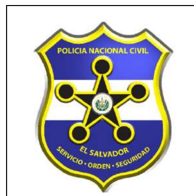
Fig. 1: Patch of the Policía Nacional Civil de El Salvador (PNC) or, in English, the National Civil Police of El Salvador

When it came time to buy Dulce's November medicines, Armandez simply didn't have the funds. But he wrote Pitts Pharmacy a check for $100 anyways. When his check bounced, Pitts Pharmacy called the police.